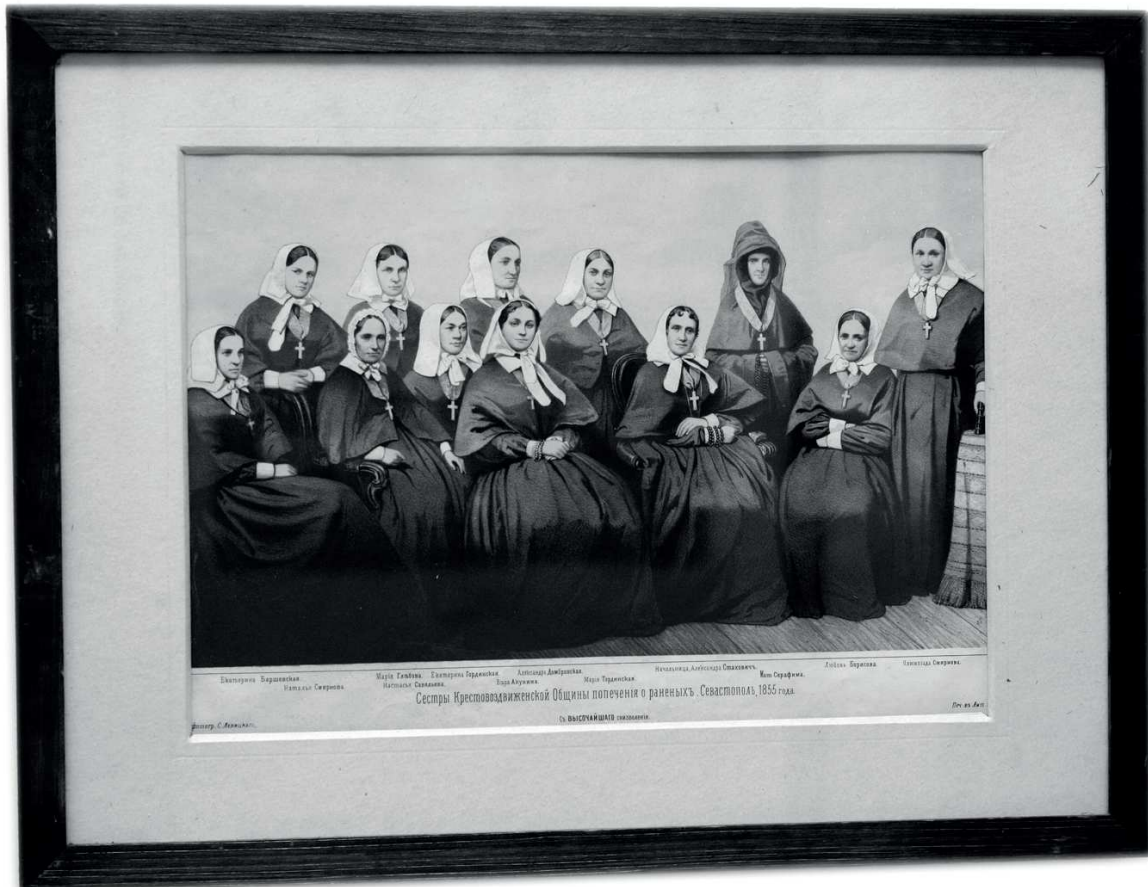
Figure 4. Lithograph: The first group of nurses who worked under Pirogov's leadership in Sevastopol during the Crimean War, 1854 – 1855. From the collections of Pauls Stradiņš Museum of the History of Medicine in Riga.