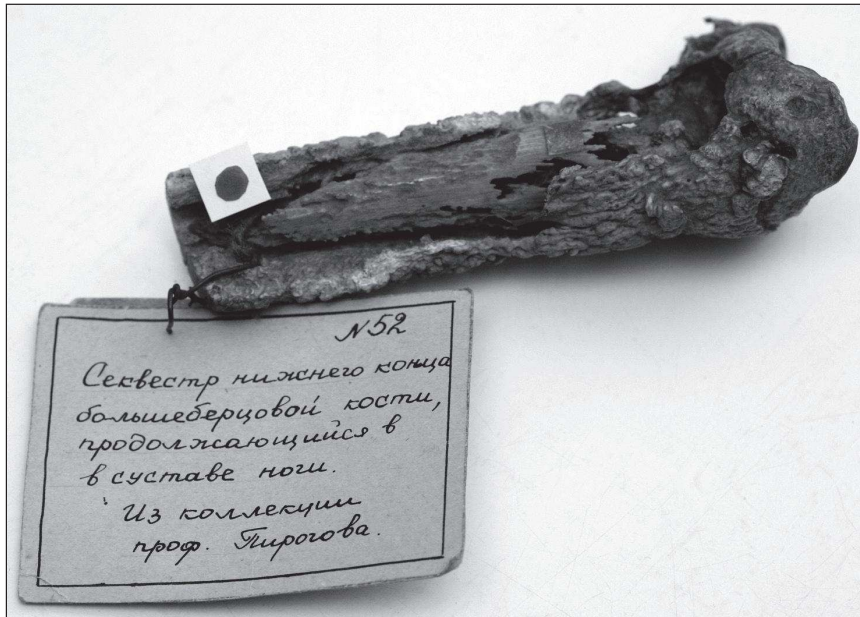
Figure 3. Pathological anatomy preparation from Pirogov's collection. 19 th century. Sequesters of the tibia. From the collections of Pauls Stradiņš Museum of the History of Medicine in Riga.

The exhibition displayed a wide array of documents, objects, books, brochures, postcards, photos and some artworks (engravings, paintings and sculptures) related to the life and activities of Nikolay Pirogov. Even the stamps issued in honour of his 150 th anniversary of his birth and some feature film posters were on exhibit. Among the most important items displayed were Pirogov's thesis on "Whether ligation of the ventral aorta is an easy and safe treatment in the case of aneurism of the groin" (Dorpat, 1832; in Latin and Russian) (Fig. 2), Pirogov's diploma from the Russian Association of Surgeons (1894), documents related to the acceptance of Pirogov at the Moscow University (1824), photos of prescriptions written by Pirogov (originals at the Pirogov Museum in Vishnya), as well as some objects of pathological anatomy from the 19 th century (Fig. 3), medical and surgical instruments of the 19 th century, lithographs of the battlefields of the Crimean War (Fig. 4), etc. Some of the anatomical drawings were made by Pirogov himself. Some of the items displayed on the exhibition were dedicated to his teachers Johann Gotthelf Fischer von Waldheim, Johann Christian Moyer, Efrem Mukhin, Justus Christian von Loder, etc.